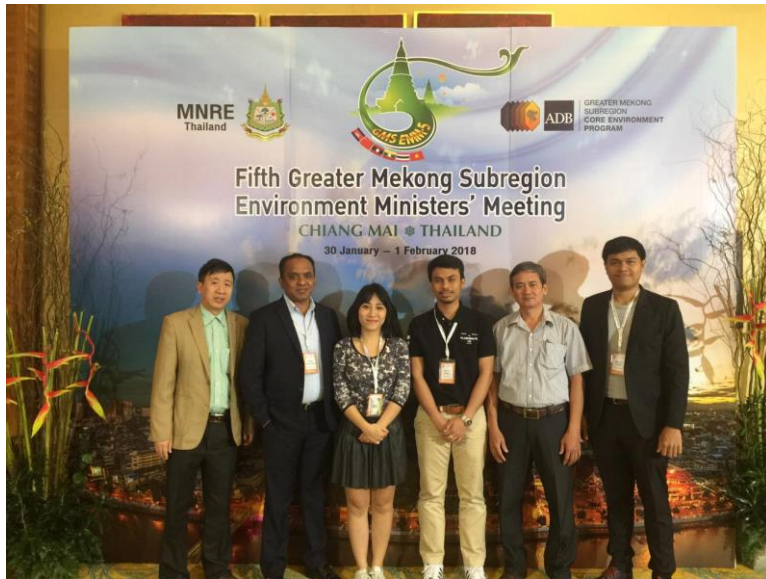
Greater Mekong Subregion Program