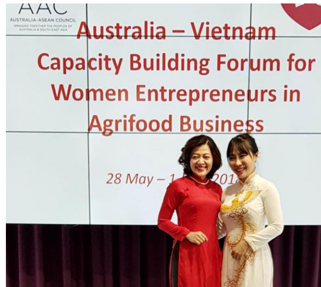
Australia – Vietnam Capacity Building Forum For Women Entrepreneurs in Agrifood Business