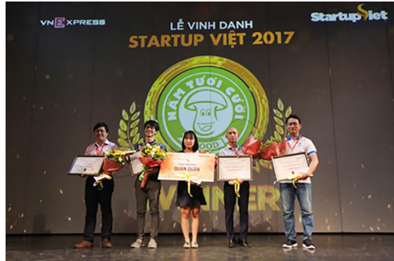
Startup Viet 2017