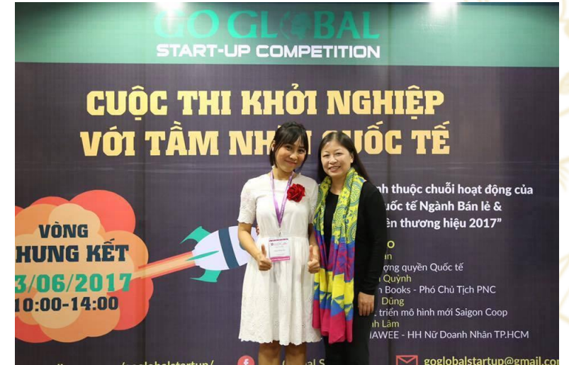
Global Startup Competition